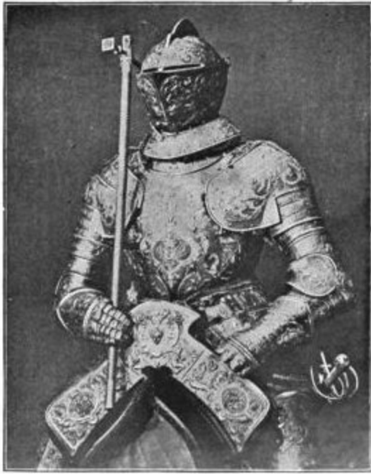
FIG. 2.—Armor of Christian II. of Denmark. Italian Renaissance Ornamentation, First half of Sixteenth Century.